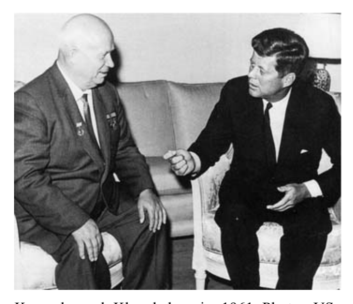
Kennedy and Khrushchev in 1961

Though it is claimed the Hotline was first used on June 5, 1967 during the six day Arab-Israeli war, the leaked NSA document suggests that Kennedy and Khrushchev did get to use soon after it was established.