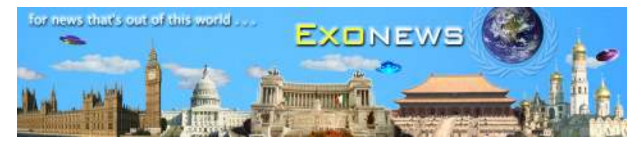
More info at: exonews.info